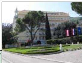
Hotel Palace - Slatina