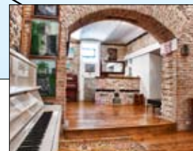
Gallery-atelier Opatijski Portun