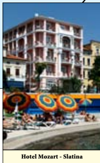
Hotel Mozart - Slatina