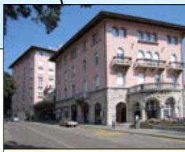
Hotel Milenij - Slatina