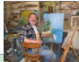
Atelier Claudio Frank - Volosko